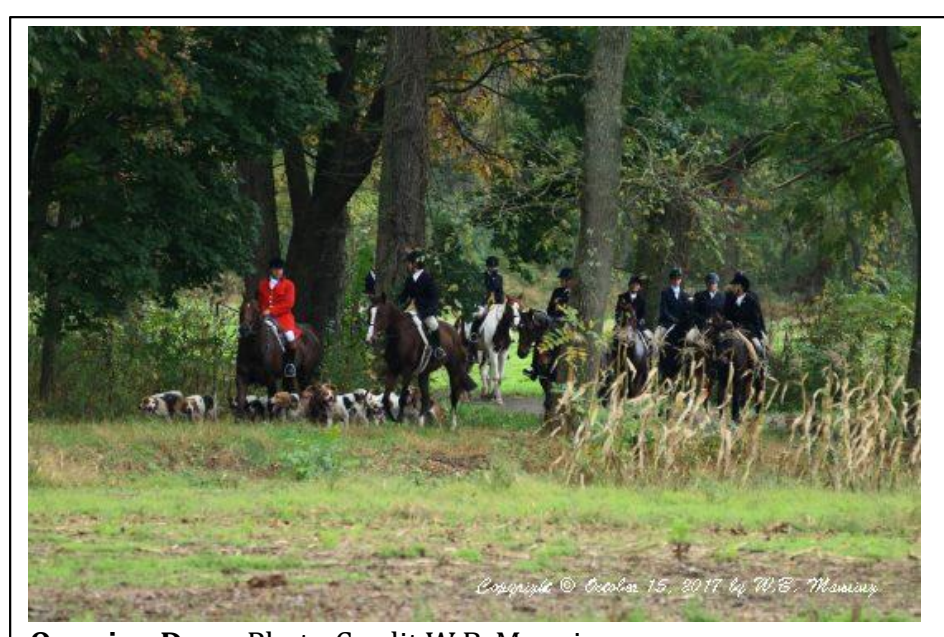
Opening Day

-Clean and inspect your tack regularlyIdeally, tack should be cleaned after every use; this is difficult, but we should all strive to clean it as often as possible. A thorough cleaning includes getting under buckles –even the many small ones found on your bridle! Conditioning your tack is also very important: it prevents the cracking and drying of the leather. Be careful, though, because there is such a thing as using too much conditioner; this can cause erosion of the stitching and a breakdown of the leather. As you clean your tack, take note of any worn spots. Quick repairs are much less expensive than replacements!